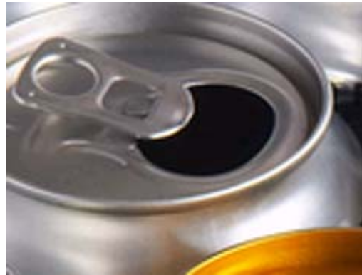
Carla Tennebaum - Tapestries from recycled materials from Sao Paolo, Brazil